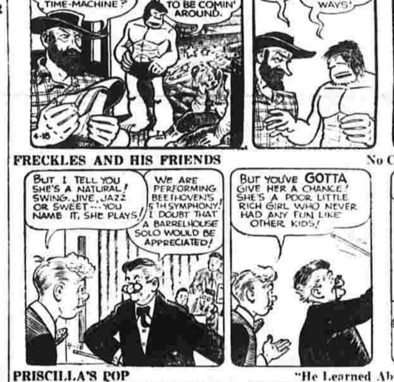
ALLEY OOP BY V. T. HAMLIN