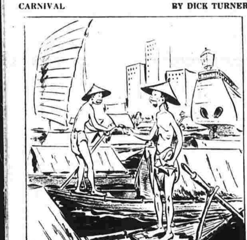
CARNIVAL BY DICK TURNER