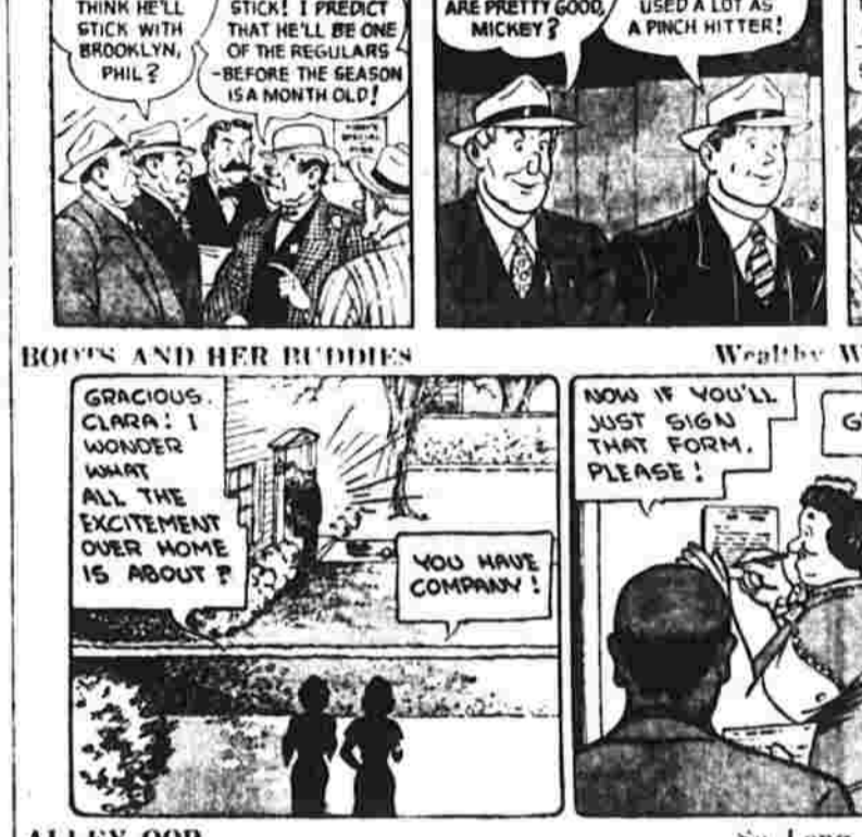
BOOTS! BOOTS! GOT A REAL BOOTS! BY EDGAR MARTIN