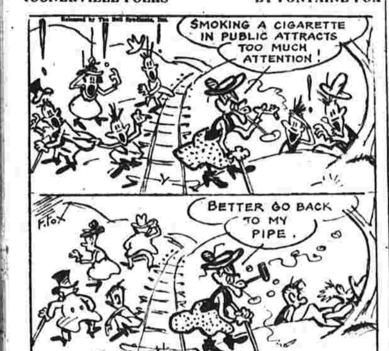
TOONVILLE FOLKS BY FONTAINE FOX

Articles for Sale 45 RESONOR will cover your stairs with 6 1/2 yards of extra heavy Astmatex carpet.